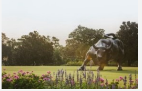
ISLEWORTH GOLF & COUNTRY CLUB Orlando, FL