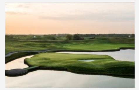
Le Golf National, Paris