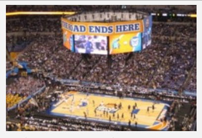
NCAA FINAL FOUR