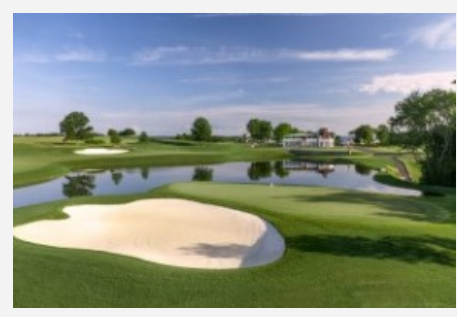
TRUMP NATIONAL BEDMINSTER Tri-State/Hudson Valley, NJ area