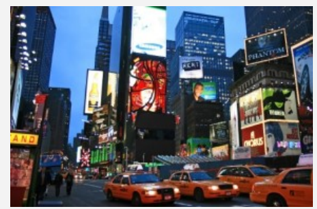
Broadway Shows and Performances