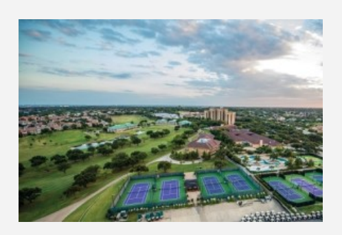
FOUR SEASONS DALLAS Dallas, TX