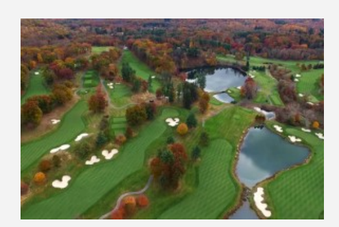
GLENARBOR GOLF CLUB Bedford Hills, NY