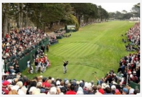
TPC HARDING PARK San Francisco, CA