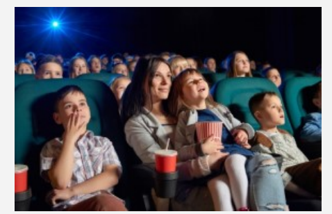
Advance Purchase Movie Tickets

Your Concierge can help with most purchases, and the online stores are always available