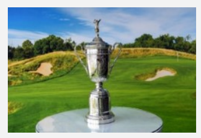
U.S. OPEN GOLF CHAMPIONSHIP