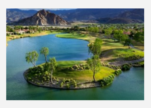
PGA WEST (COMING SOON) La Quinta, CA