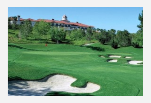
SPANISH HILLS COUNTRY CLUB Camarillo, CA