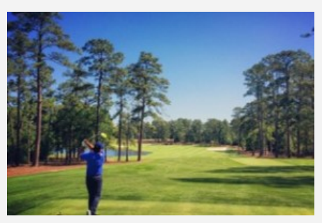
BLUEJACK NATIONAL Houston, TX area