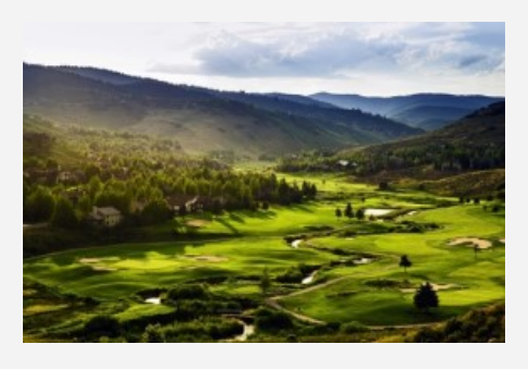
JEREMY RANCH Park City, UT