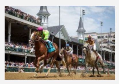
THE KENTUCKY DERBY