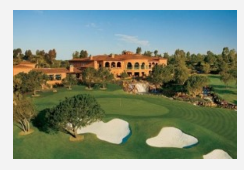
THE GRAND GOLF CLUB San Diego, CA