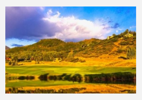
SNOWMASS CLUB Snowmass Village, CO