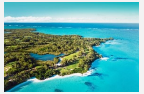
Ile Aux Cerfs, Mauritius