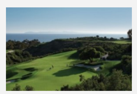
PELICAN HILL GOLF CLUB Newport Coast, CA