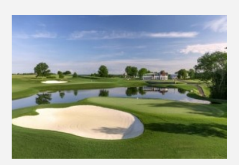
TRUMP NATIONAL BEDMINSTER Bedminster, NJ