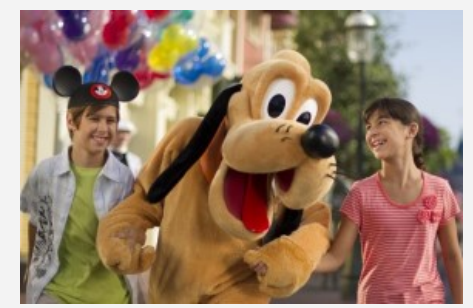
Tickets to WALT DISNEY WORLD® Disney artwork/properties: © Disney