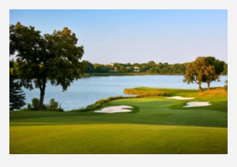
HAZELTINE NATIONAL GOLF CLUB Chaska, MN