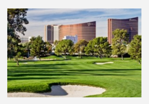
LAS VEGAS COUNTRY CLUB Las Vegas, NV