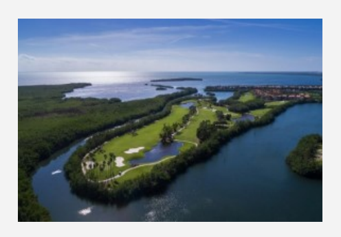
DEERING BAY COUNTRY CLUB Coral Gables, FL