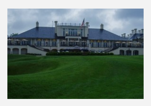
BELLE HAVEN COUNTRY CLUB Alexandria, VA