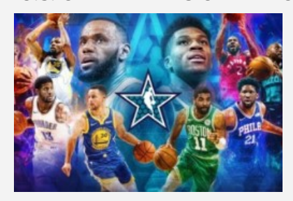
NBA ALL-STAR GAME