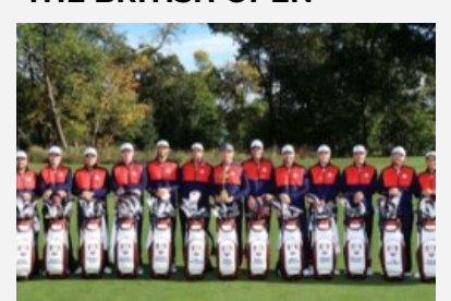
THE RYDER CUP