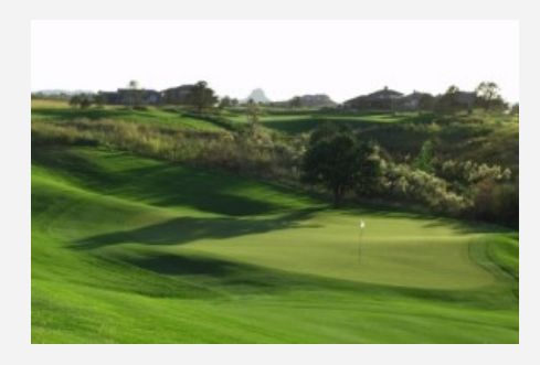
THE CLUB AT PRESCOTT LAKES Prescott, AZ