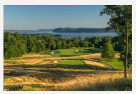
THE TRADITION La Quinta, CA