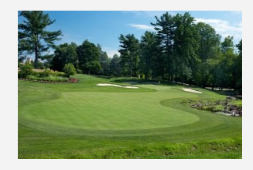
TPC JASNA POLANA Princeton, NJ