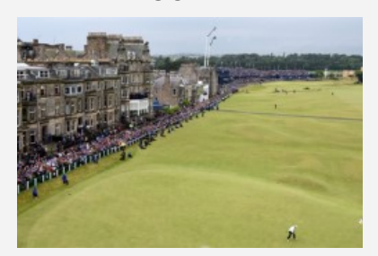
THE BRITISH OPEN