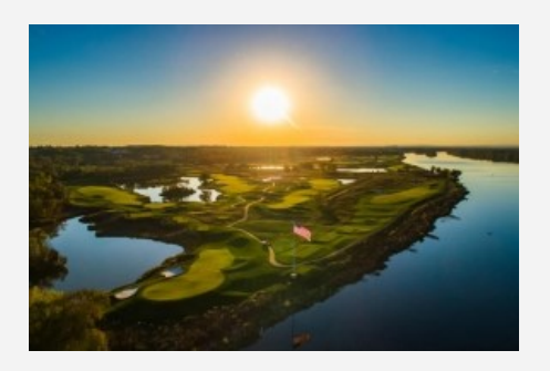
TRUMP NATIONAL D.C. Washington D.C.