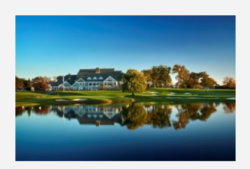
THE CLUB AT WYNSTONE Chicago, IL