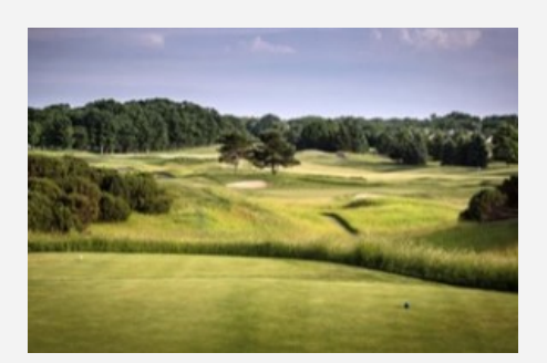
CONWAY FARMS GOLF CLUB Chicago, IL area